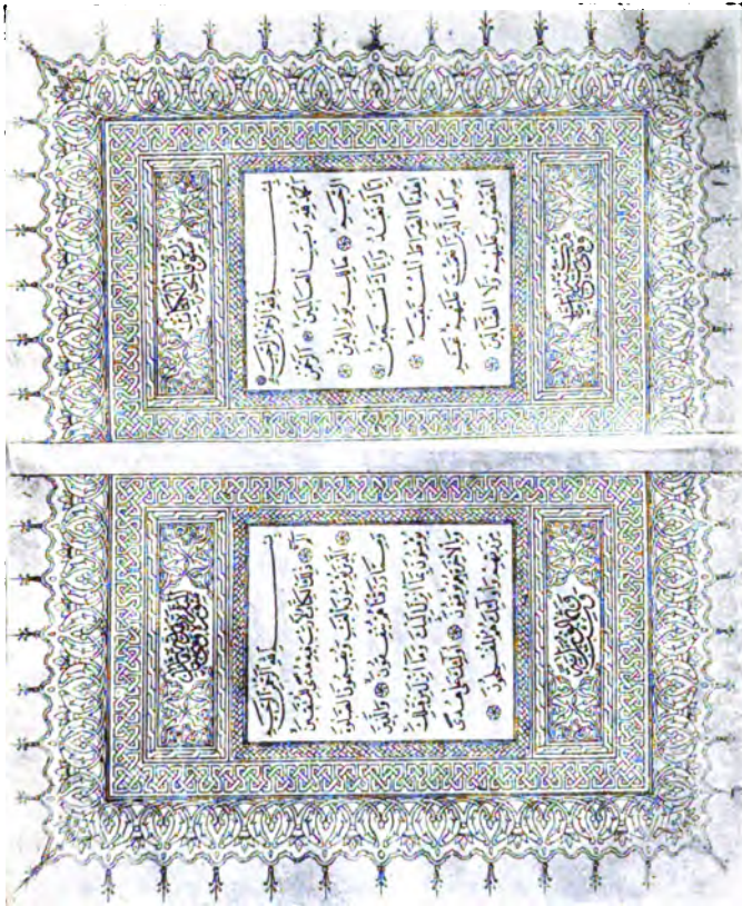
A VERSE OF THE KORAN